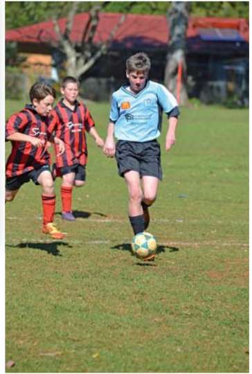
Football brings out desire and competitive spirit.