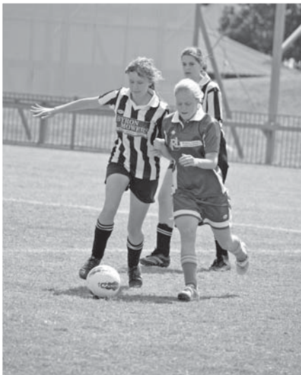
Female football is an important part of local participation