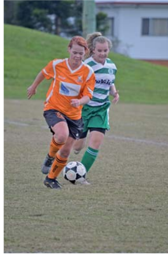
Female football continues to be popular with participants