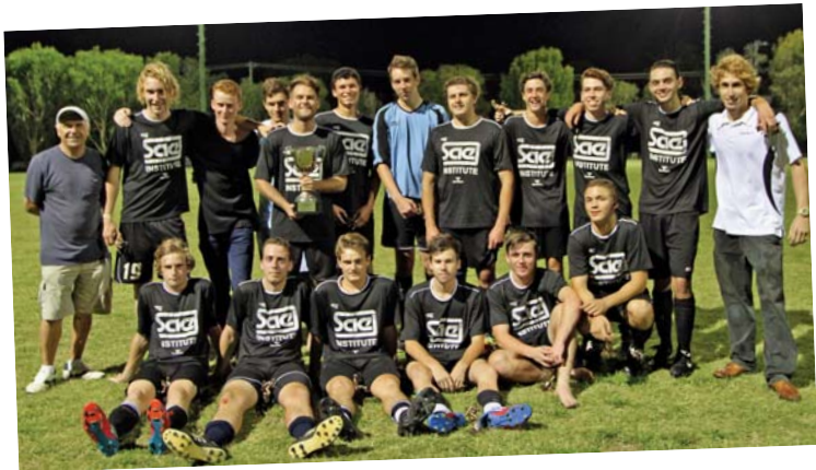
Winning Team Byron Bay FC 2012 TURSA Employment and Training Summer Youth League