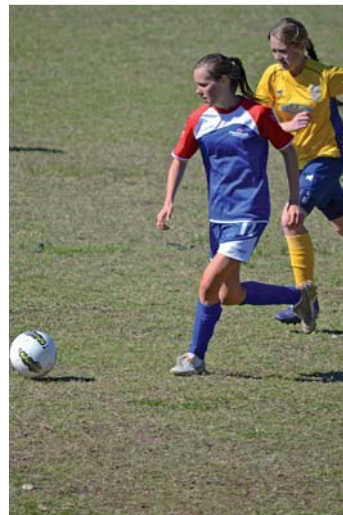
FFNC participated in the Queensland Junior Premier League for several years until that program was dissolved at the end of 2012.