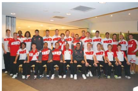
Melbourne Heart squad that spent a week in Lismore in August 2012