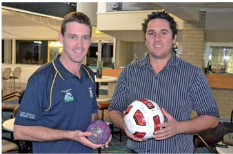
South Lismore Bowling Club continues to be a great sponsor of the Referees Association