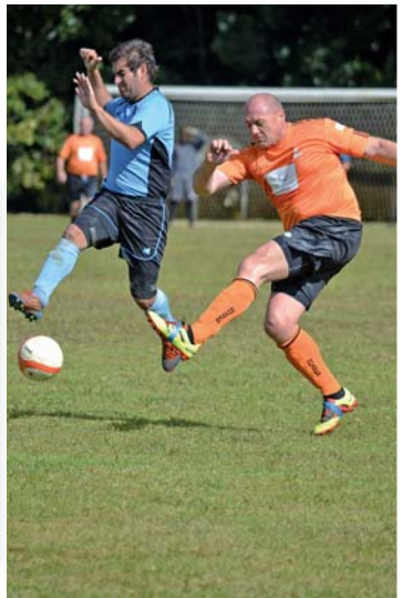
Even Men's 6th Division can still produce plenty of exciting football.