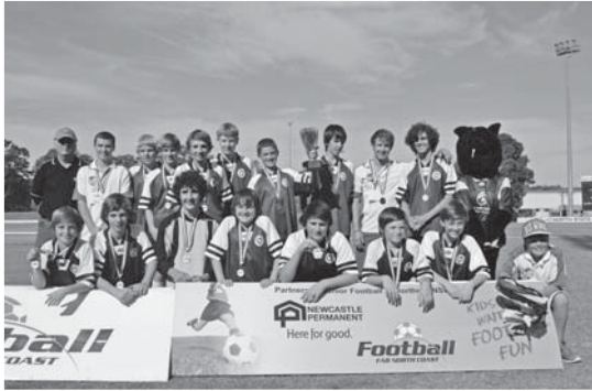
Grand Final glory for Pottsville Beach in Grade 14